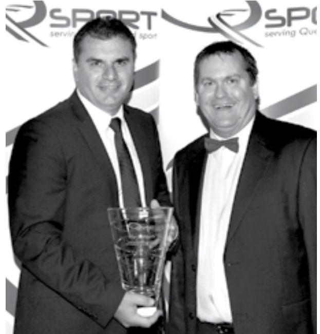
Ange Postecoglou (left) from Brisbane Roar received the Queensland Sport Coach of the Year award from Minister for Sport The Hon. Phil Reeves (right).

Along the way, he assembled a potent force that produced a 28 match unbeaten streak in 2011 – an Australian domestic football record in any code.