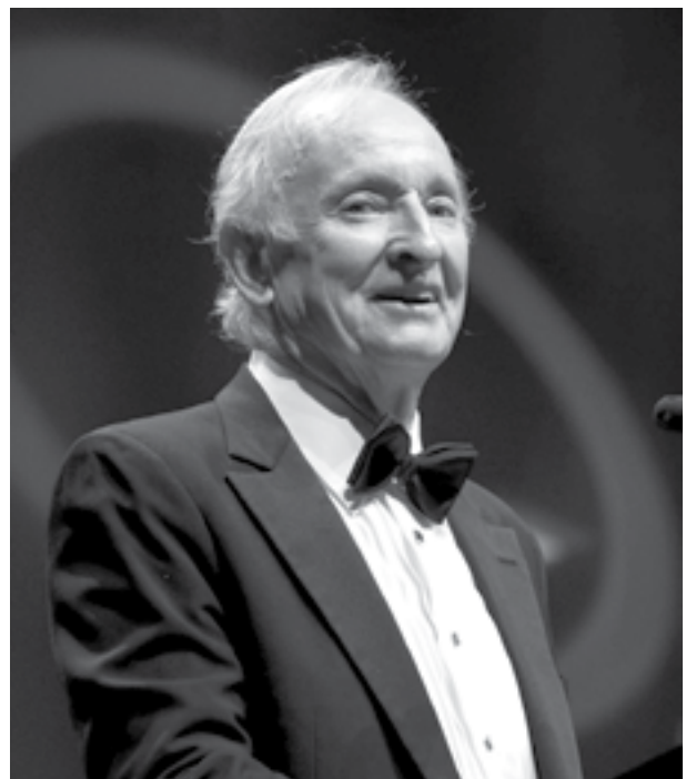
Tennis Great Rod Laver

Rod Laver, along with fellow tennis great Roy Emerson and world golfing legend Greg Norman, came from the USA for their installation as Legends in the Queensland Sport Hall of Fame, with the late George Moore and more modern era champions in Allan Border, Mick Doohan, John Eales, Catherine Freeman, Susie O'Neill, Kieren Perkins and The Courier-Mail promotion's Top Queensland Sporting Legend in "The King" Wally Lewis.