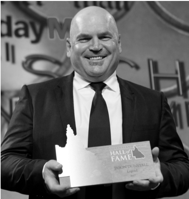
Jason Dunstall, the 17th Legend installed in the Queensland Sport Hall of Fame.

competitiveness and unselfishness that even then was second to none. And he never lost it.