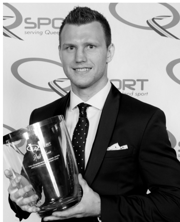
The Courier-Mail Channel Seven Queensland Sport Star of the Year world champion boxer Jeff Horn

the Brisbane Convention and Exhibition Centre as the venue for this promotion and recognition of Queensland sport and its top achievers since the Awards Presentations' inception in 1995.