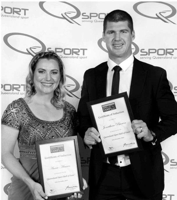
Hall of Fame inductees, Anna Meares (cycling) and Jonathan Brown (AFL)

Emma McKeon and Shayna Jack that broke the world record in the women's 4 x 100m relay at the Commonwealth Games in April winning the XXXX Sport Team of the Year and young star on the rise in 17 year old Ariarne Titmus The Courier-Mail Channel 7 Junior Sport Star category.