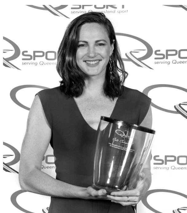
Sport Star of the Year, swimming's Cate Campbell

Female swimmers scooped the pool of awards on offer with the all Queensland Australian freestyle team of Cate and Bronte Campbell,