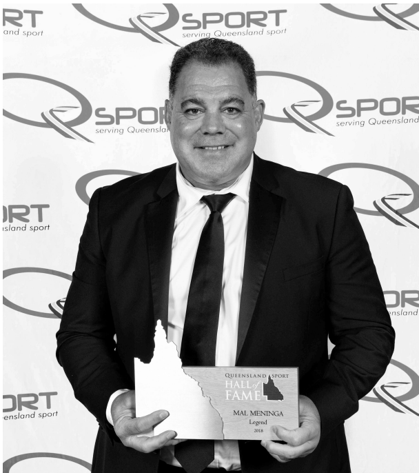
Mal Meninga, the 18th Legend in the Queensland Sport Hall of Fame

the Canberra Raiders. More than 300 first-grade games, 32 State of Origin games for Queensland and 46 games for Australia - 23 as captain. All despite an arm he broke more times than he might care to remember.