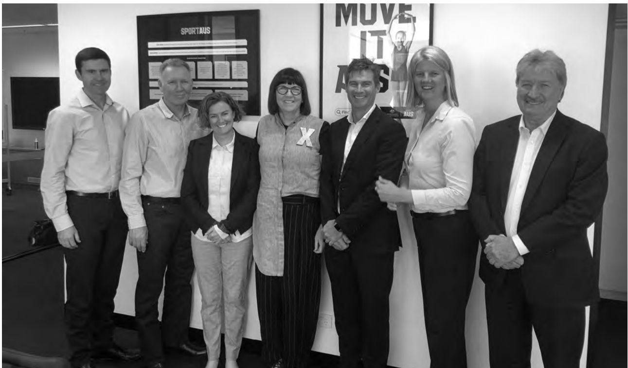
Community Sport Australia Ltd directors with Sport Australia executives, March 2019

QSport is analogous to the Sports Federations of other Australian States which collectively form Community Sport Australia Ltd.