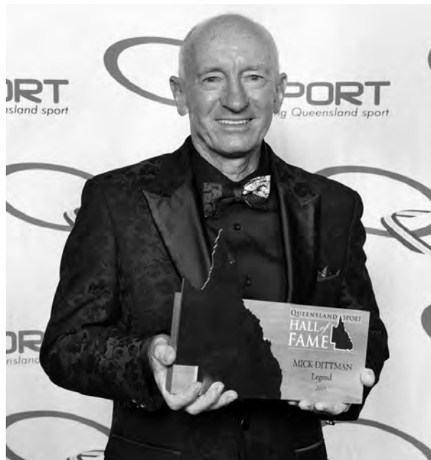
Mick Dittman, the 19th Legend installed in the Queensland Sport Hall of Fame.

A highlight of the night was the installation of horse racing great Mick Dittman as the 19th Legend in the Queensland Sport Hall of Fame.